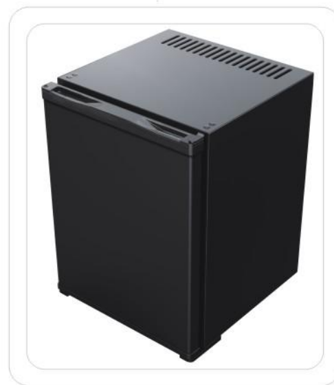
Old Solid Door