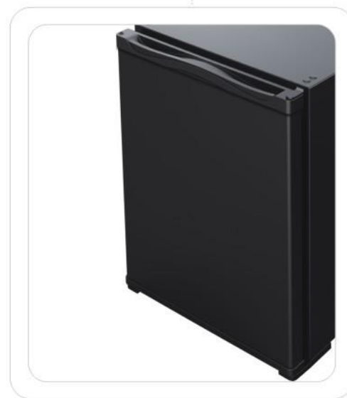
New Solid Door