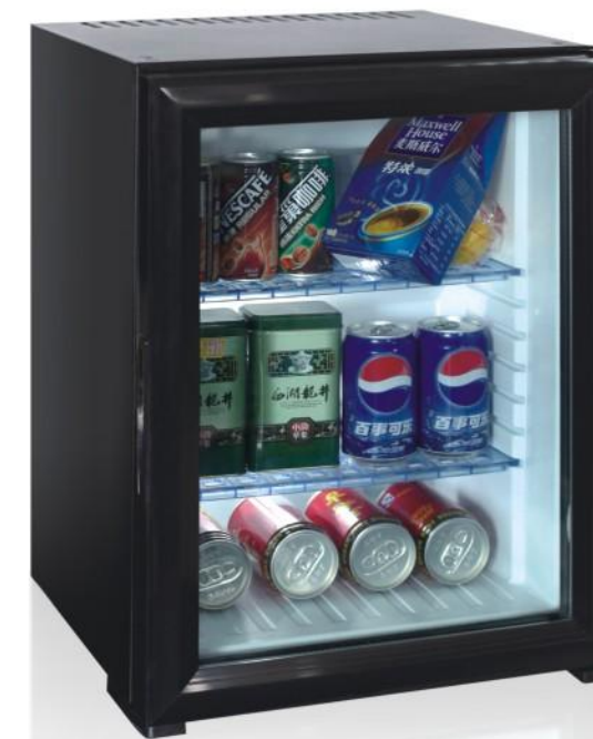
Glass Door ( 玻璃门 )