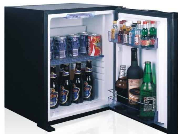
Solid door ( 实心门 )