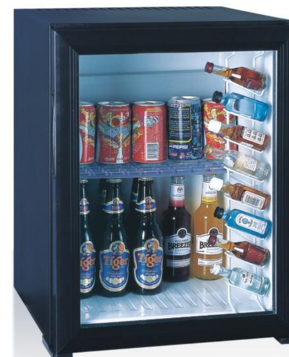
Glass Door ( 玻璃门 )